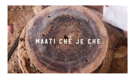
Title - Maati Che Je