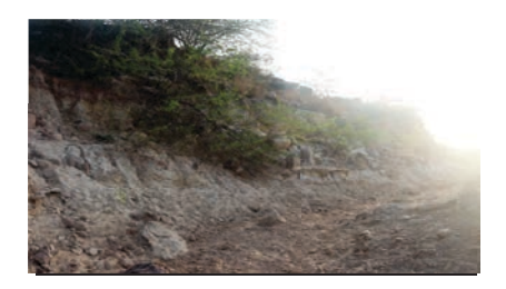
Big Craters instead of clay at pond site